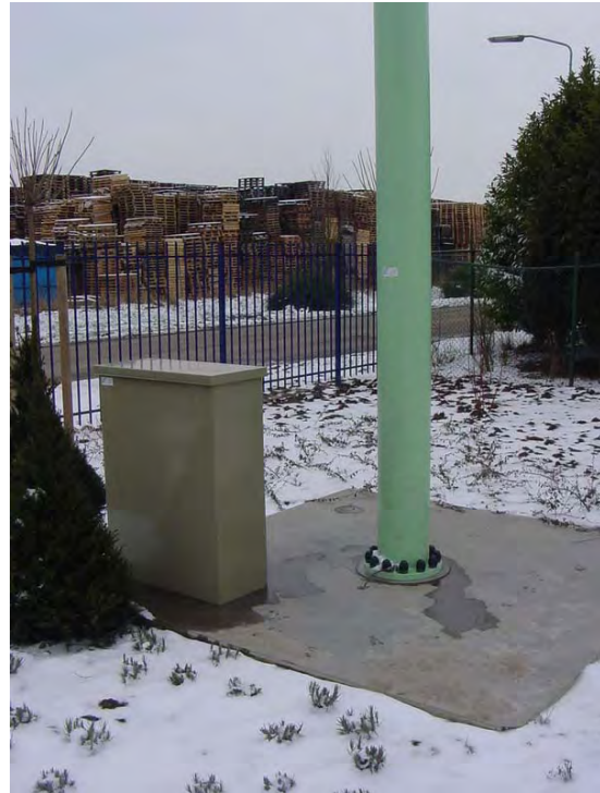
Control Cabinet on Foundation