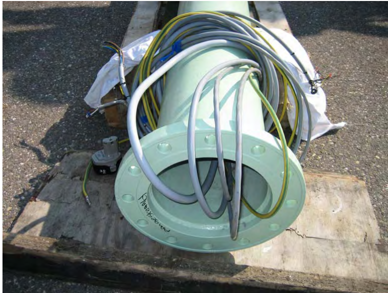
Tulipo Tower Foot & Cables

The nacelle assembly is put on a tubular steel tower. The tower is protected against corrosion through hot dip galvanising and a coating. The wind turbine is standard coloured light green (RAL 6019) and the standard length of the tower is 12 meters. The used steel has a high fracture toughness avoiding brittle fracture at low temperatures.