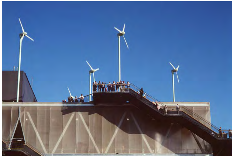
Tulipo's on roof of 6 storey Dutch Pavilion, Expo 2000, Hannover, Germany.