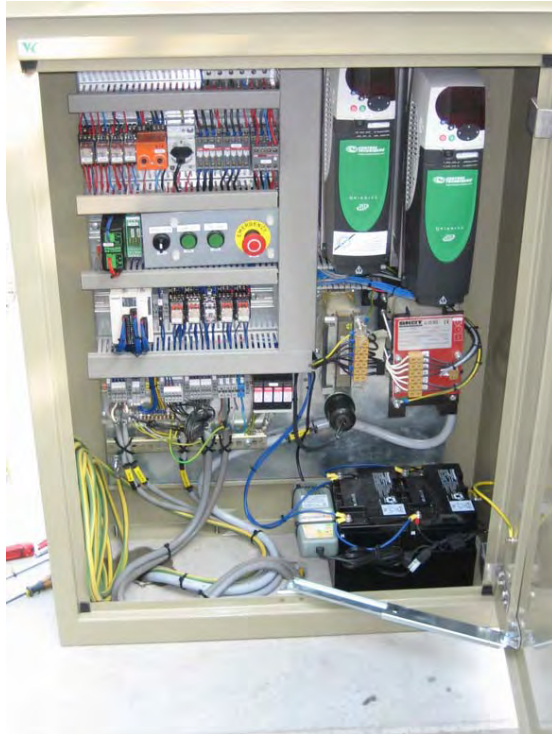
Fully Equipped Control Panel with IGBT inverters